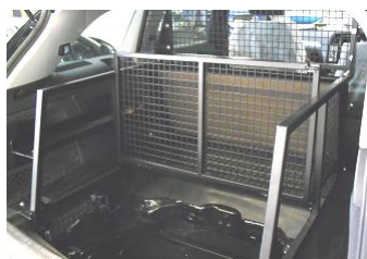
EVO Rear Stowage system with Grill Bulkhead – ↑ shown with load area lid up position