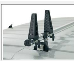
Easy to adjust roof bar guides